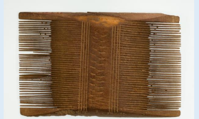
Combs Just like a modern comb, these are used for brushing hair. Combs could be made of different materials. Some combs were made of hippopotamus ivory!