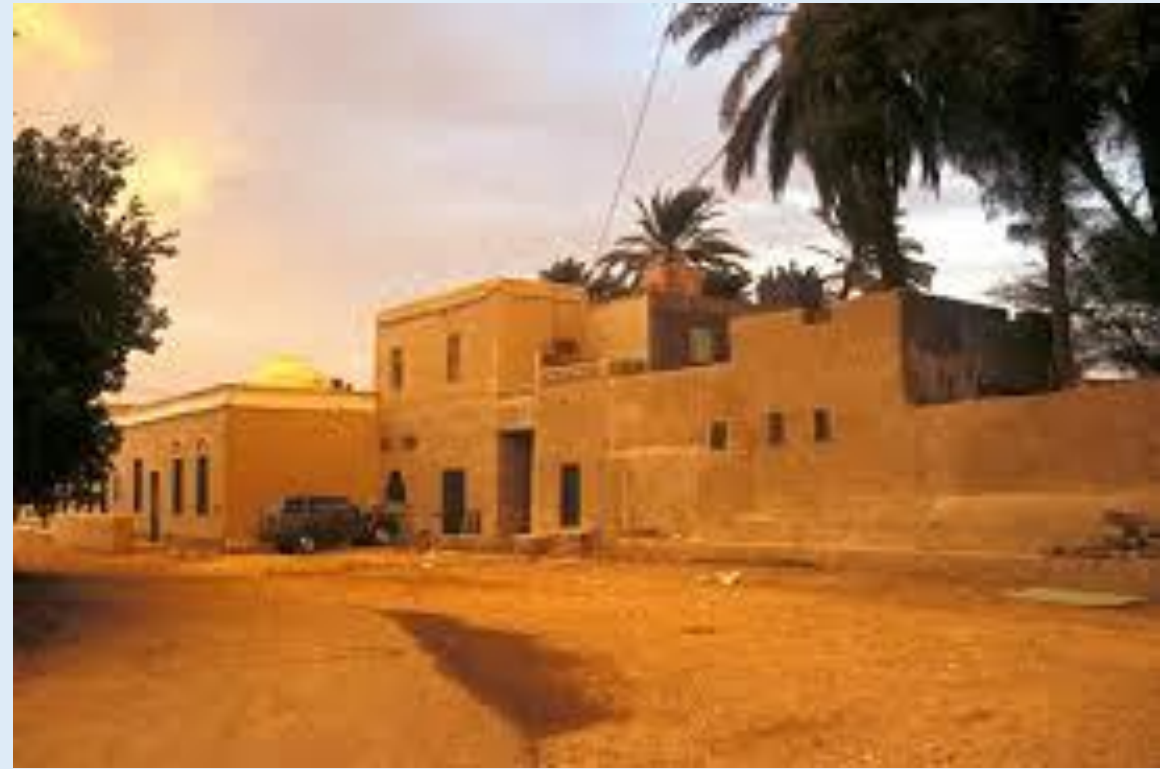
Rich Egyptian house