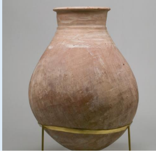
Pots Clay pots were used for storing things like water, beer and food.