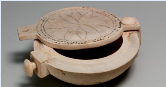
Cosmetics Pots like these were used to store make-up and cosmetics. Ancient Egyptians decorated their eyes with black kohl eyeliner. Both men and women painted their eyes.