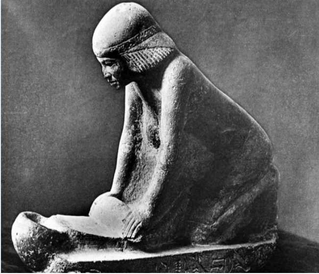
Querns The ancient Egyptians used stone querns like this to grind wheat into flour.