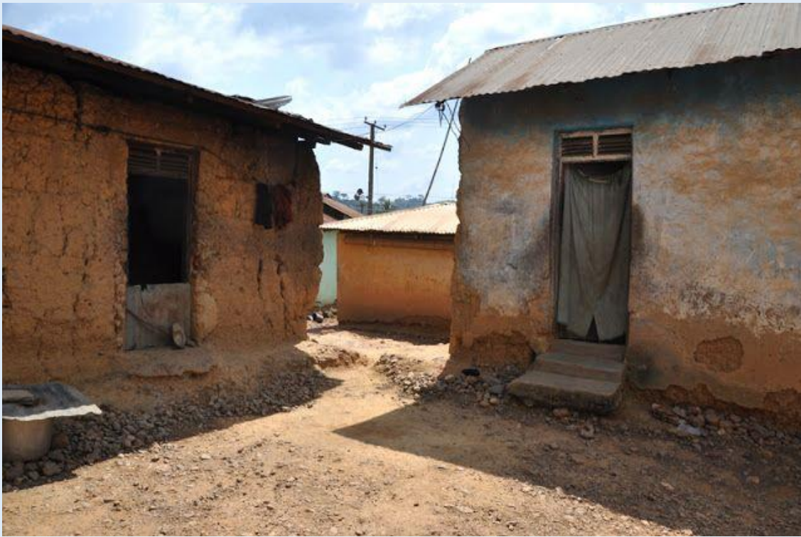
Poor Egyptian house

Prepare for learning: How are these two houses different?