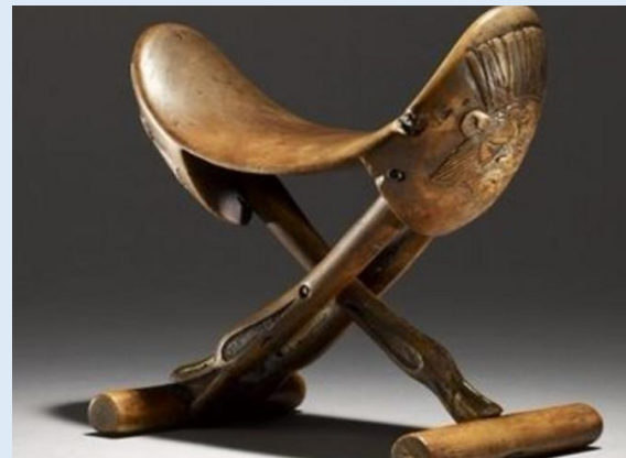
Headrests There were no pillows in Ancient Egypt. To get comfortable wooden headrests like this were used.