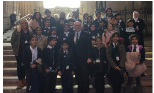
Thornton councillors and head boys and girls meet Liam Byrne, our local MP at the Houses of Parliament.